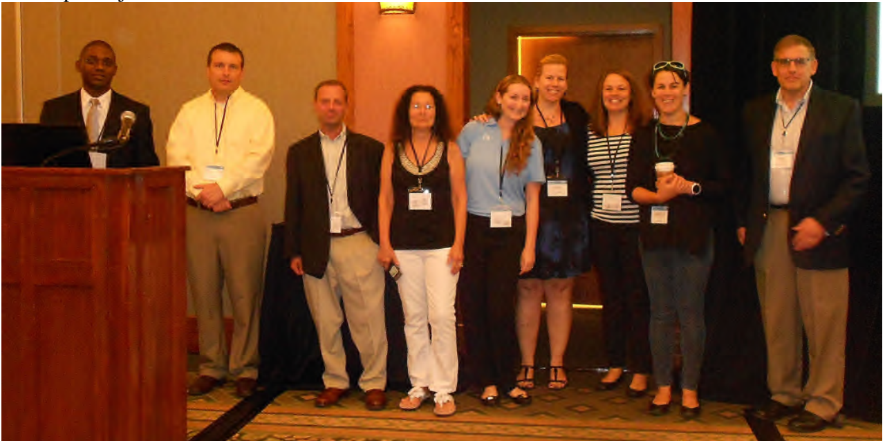
Conference Planning Team

A few other photos from the meeting may be found on the Conference web site, http://www.awma-ss2015conference.com/?page_id=79 . Below are a few additional ones taken by the editor, who is far from a photo-journalist.