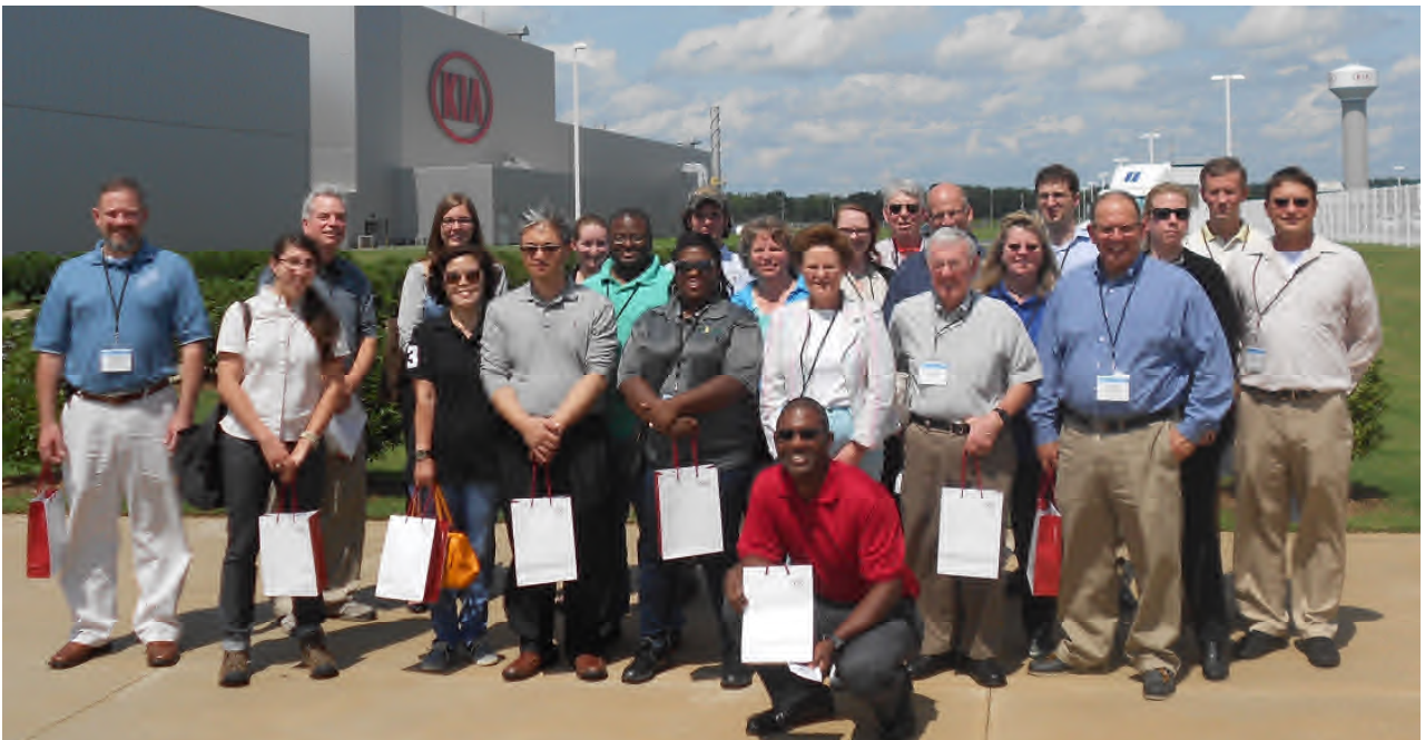
Kia Tour Group after tour arranged through courtesy of GA Power