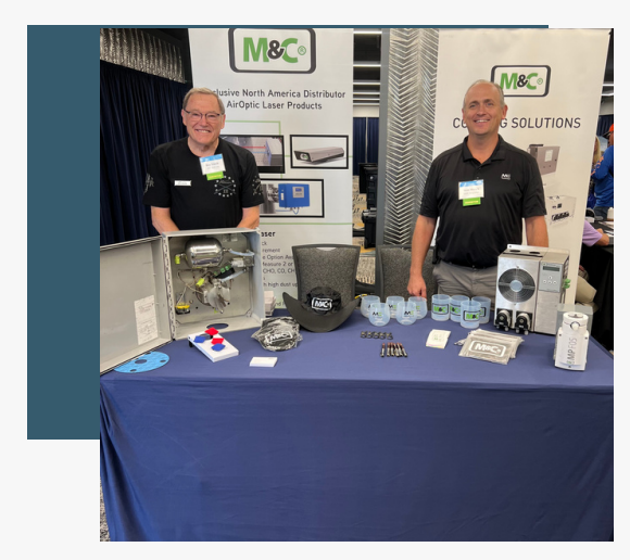
TERRELL TECHNICAL SERVICES