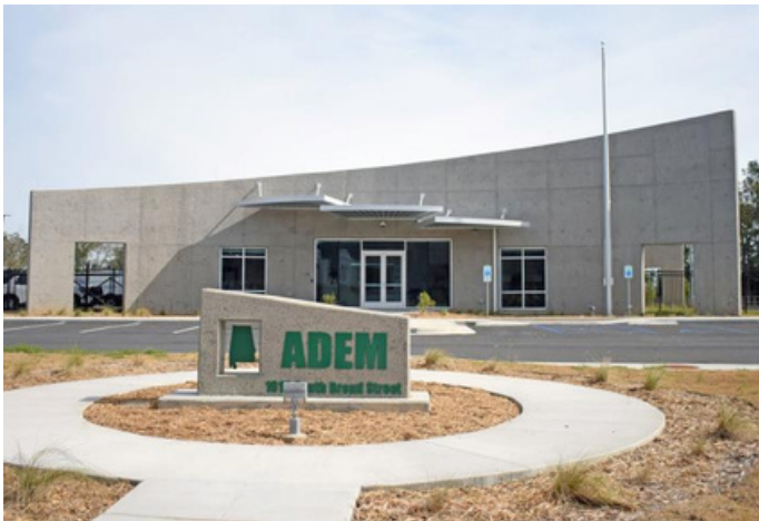
The LeFleur Coastal Alabama Field Office in Mobile

The Lance R. LeFleur Coastal Alabama Field Office is a first of its kind. It combines green infrastructure with numerous environmentally friendly features to help sustain Alabama's natural resources.